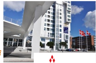
Tivoli Congress Center DOWNTOWN COPENHAGEN

The three days programme included a variety of clinical, educational, and research topics, able to provoke lively discussions between the more than 700 delegates from 32 countries.